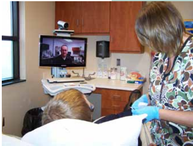
Calais Regional Hospital now has a telemedicine connection to a variety of specialists for emergency and acute care patients. In the above photo CRH staff demonstrate how the telemed equipment is used for a patient consult.

At Calais Regional Hospital, we work hard to bring our community members the best in healthcare. We are very excited to be able to provide local , high quality access to these specialty care services.